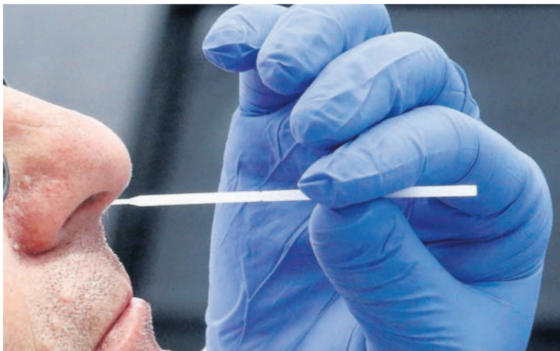
In this Friday, June 12, 2020 file photo, a nurse uses a swab to perform a coronavirus test in Salt Lake City.

There have been more than 2 million confirmed coronavirus cases in the U.S. and more than 115,000 deaths, according to data compiled by Johns Hopkins University. Cases in nearly half of U.S. states are rising. In recent weeks, preliminary findings have flagged po-